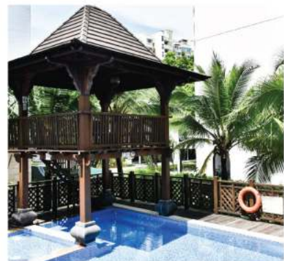
(The above photos show the swimming pool areas of the Jervois Residences)