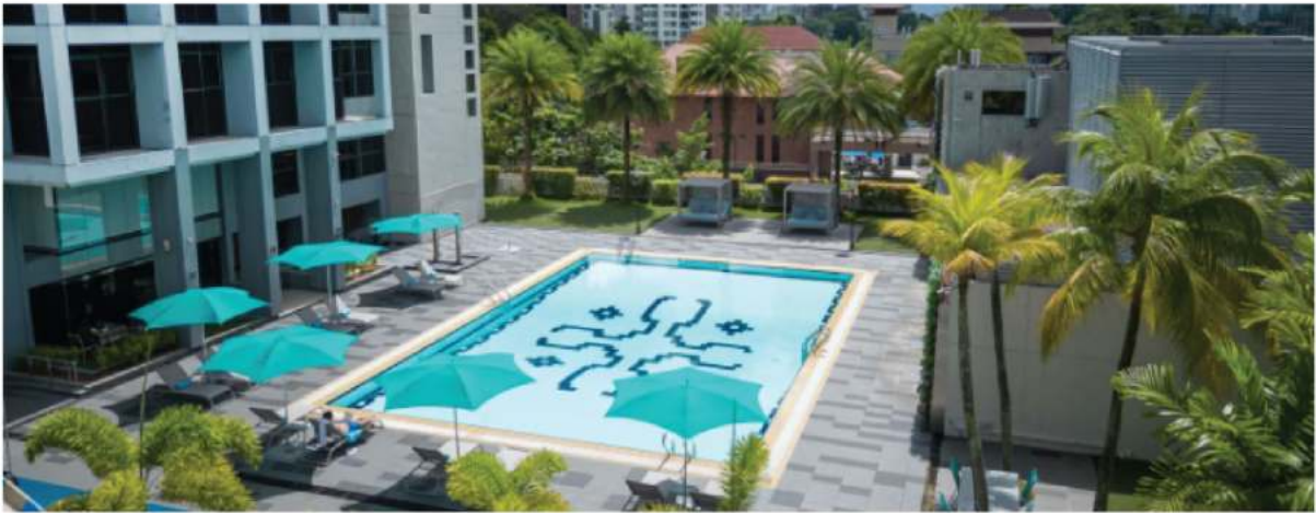
(The above photo show the swimming pool area of the Novotel Residences)