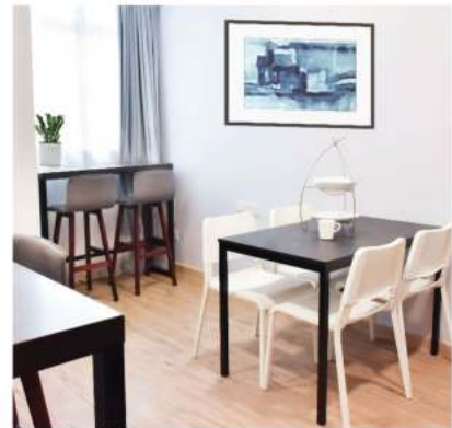
(The above photos show the common areas of the Dalvey Residences)

NB services can be denied under hostel terms and conditions with FIS